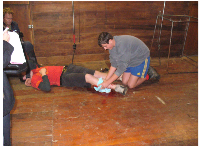
First Aid Challenge