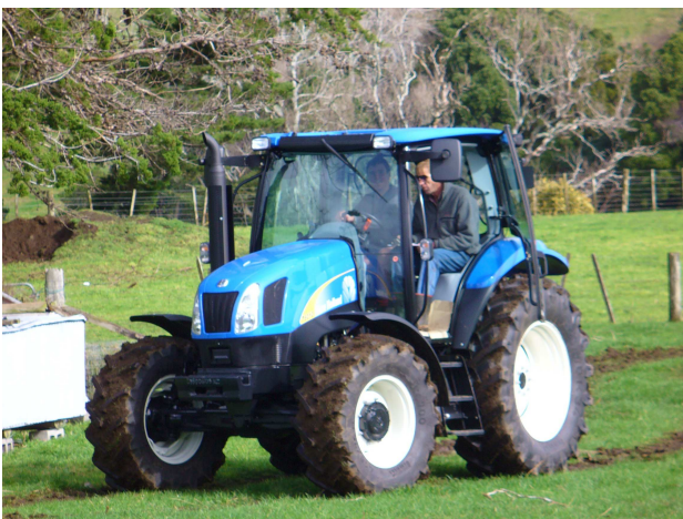
Tractor Driving Challenge