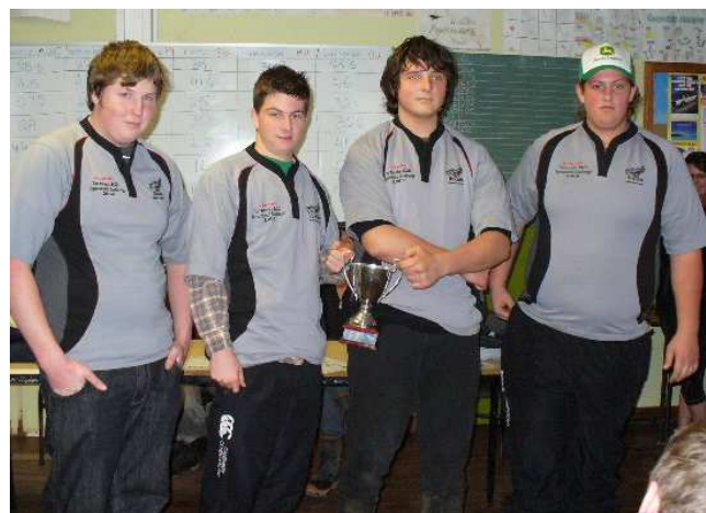
Hawera High School – winners of the 2008 Team Challenge Trophy