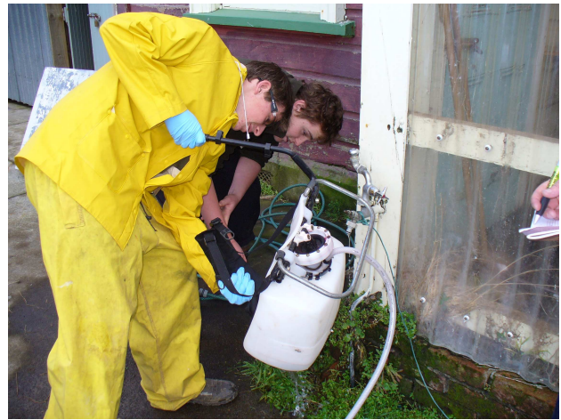
Chemical Handling Module – marks are awarded for wearing protective clothing correctly... and using the right chemical for the right job!